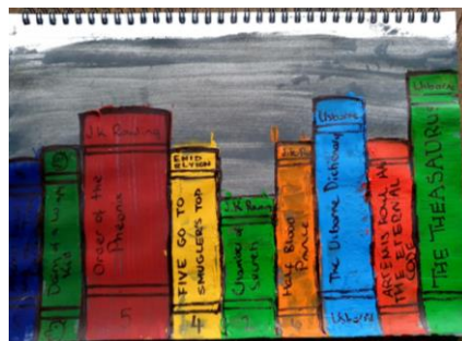
Ahsen Tarafdar- using a credit card to create a picture