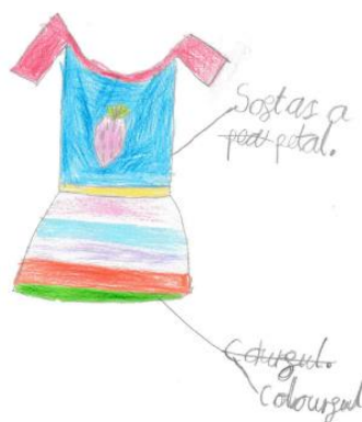
Audrey Carey – combining the softness of petals with the colours of gems & crystals.

Year 4 completed an art project based on An Experimentation on a Bird in the Air Pump by Joseph Wright. They looked at emotions represented in the painting and colour mixing. We were so impressed with the beautiful feather designs that we received, here are a few examples.