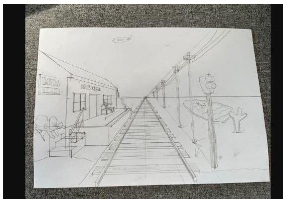
Olly Turner perspective drawing.

A big well done to all the children in years 2, 3, 4 & 5 for completing their home learning to such a high standard. We are really looking forward to seeing you all in school again in September.