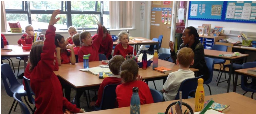
Photo of History Club discussion about importance of Black History.